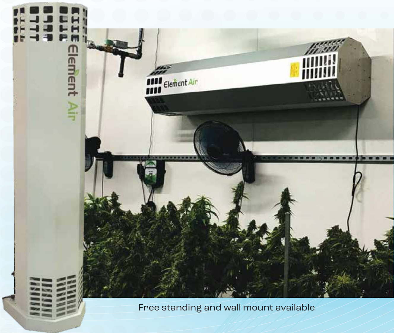
Free standing and wall mount available