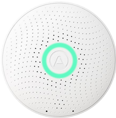
Airthings Wave Plus