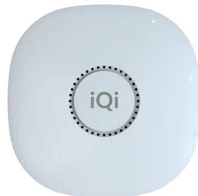
IQI Air Quality Monitor