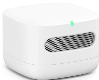
Amazon's Smart Air Quality Monitor